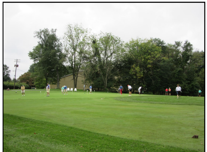
Practice Putting Green