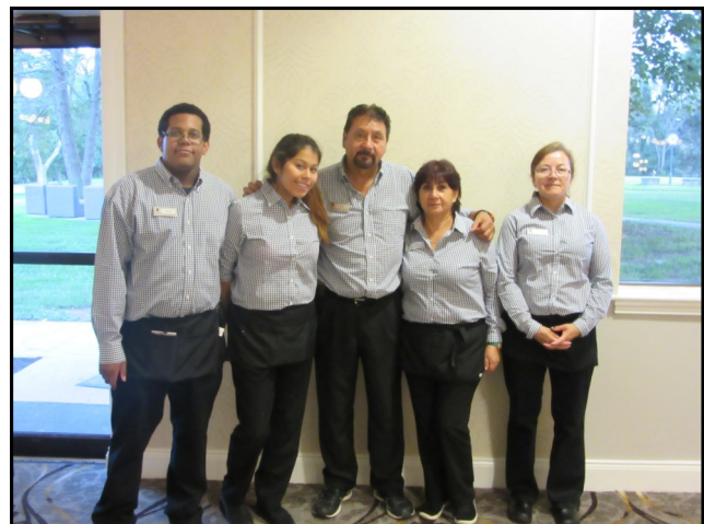
The NCC Dining & Bar Staff