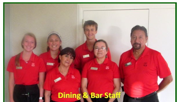
Dining & Bar Staff