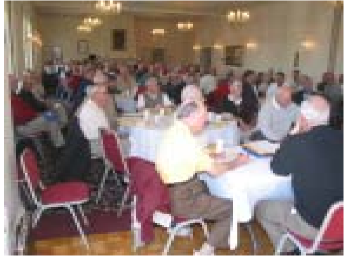
The MISGA Club Reps Meeting in April at Chester River