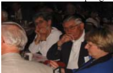
Past Pres Ewalt