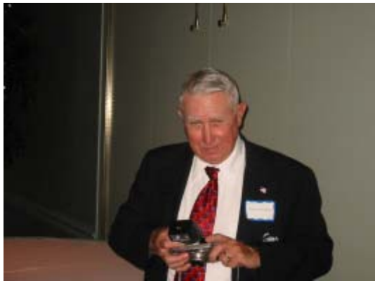
Charlie Fieldhouse, the MISGA Photographer