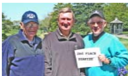
2ND PLACE SEASIDE