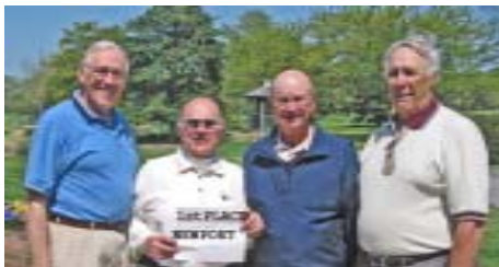
2ND PLACE NEWPORT